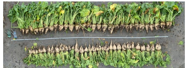
2 x Kinsidro Grow+ applications