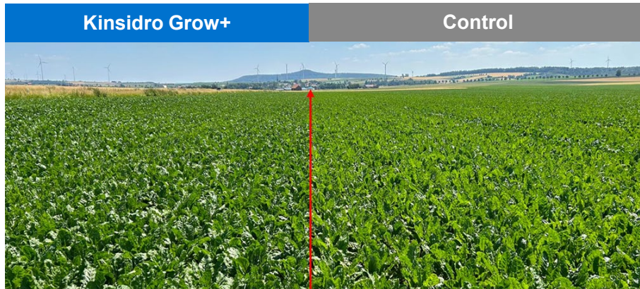
German Trial Yield data (kg)